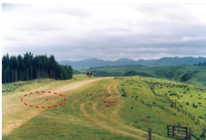
Agricultural airstrip with soft patch

The pilots must report incidents and accidents in accordance with Civil Aviation Authority Rules Part 12 and serious harm under the Health and Safety in Employment Act 1992.