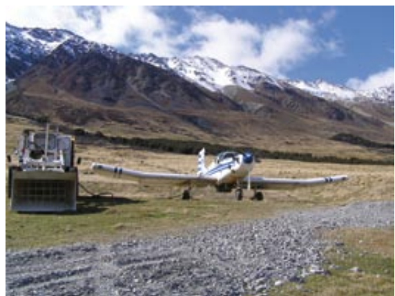
Ground-based refuelling operations.

Employers and self-employed people must also abide by the aviation safety reporting requirements of the Civil Aviation Authority Rules Part 12 and the serious harm reporting requirements of s.25 of the Health and Safety in Employment Act 1992.