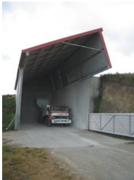
Example of good fertiliser storage facility

Providing a weatherproof storage area for top-dressing fertilisers can therefore reduce the cost of the operation and remove a very real hazard to safe top-dressing operations.