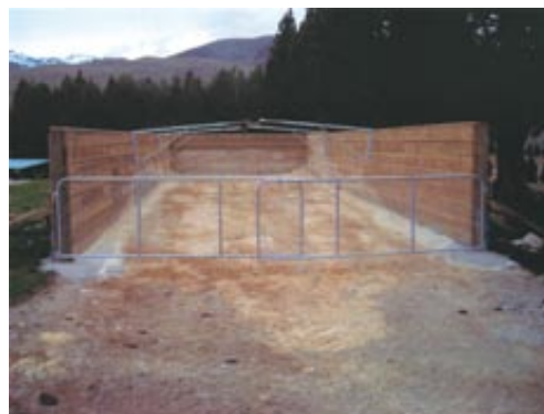
Storage bins and frames for tarpaulin roof