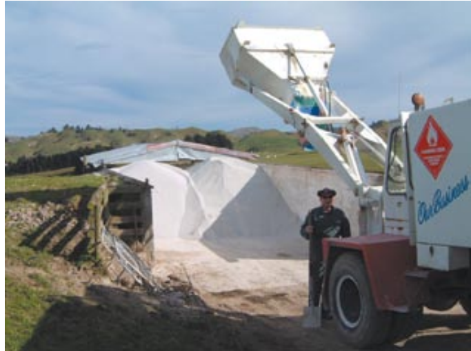
Fertiliser bin with sliding roof in back position for access

The fertiliser storage site may be inspected for suitability on request from owners, farmers, transport operators, top-dressing operators, pilots or loader/drivers. The inspection may be carried out by an appointed health and safety inspector who may refer to this guideline.