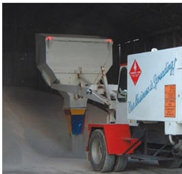
Hopper with free-flowing fertiliser

The procedure for the field test involves two steps: