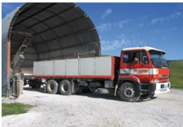
Truck access bin

It is the responsibility of the farmer to store the material in a manner that ensures that the condition of the fertiliser remains free-flowing while in storage and that it continues to satisfy these requirements when being extracted from storage for use.