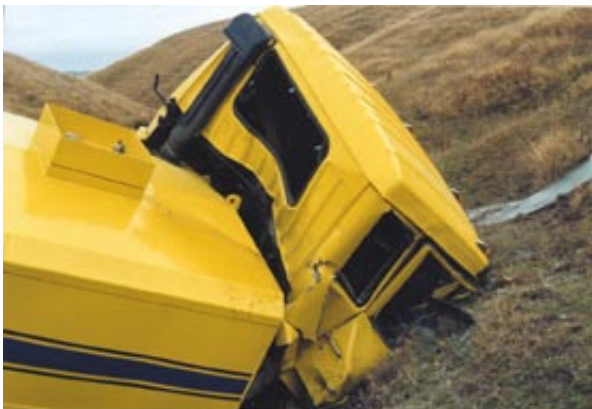
Above and below: Vehicle accidents can and do happen. Always take all practicable steps.

Transport of fertiliser, machinery and fuel for top-dressing operations normally requires the use of heavy transport. Access to storage areas on or near the top-dressing airstrip should be via a graded and, if practicable, gravelled road that is well drained and maintained. Although some tracks and roads are not gravelled and are used only in good weather conditions, they shall nevertheless be