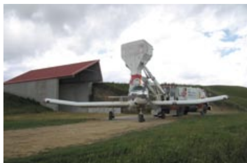
Loading plane using new bin